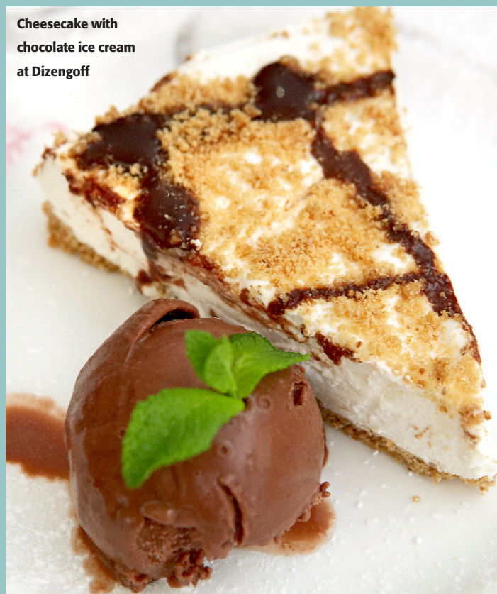
Cheesecake with chocolate ice cream at Dizengoff

'It's not the most attractive room, and the wipe-clean menus don't change often, but the food is fresh and has great flavour. It's very